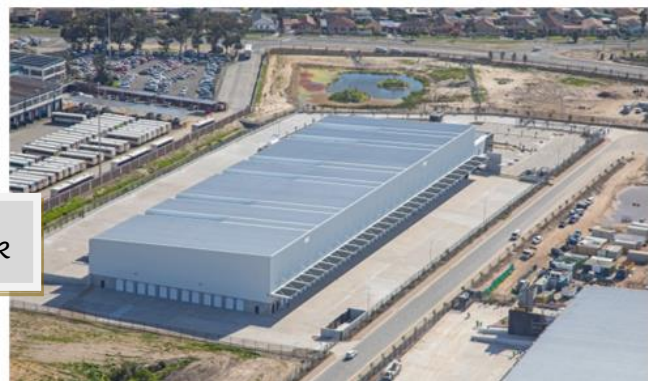
King Air Industrial Park